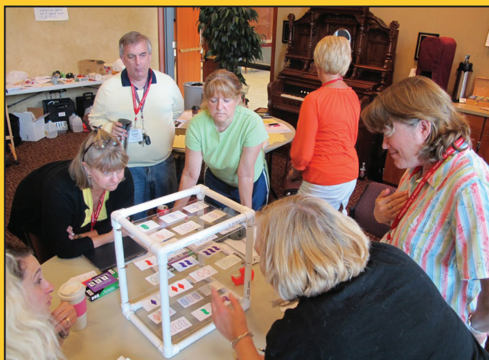
Scenes from the Heartland MTC's summer workshop at the Bell Cultural Arts Center at MidAmerica Nazarene University in Olathe, Kansas.