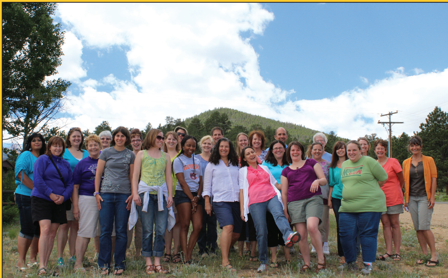
Participants at the Northern Colorado MTC’s immersion workshop in Estes Park pose for a photo together at the conclusion of the workshop.