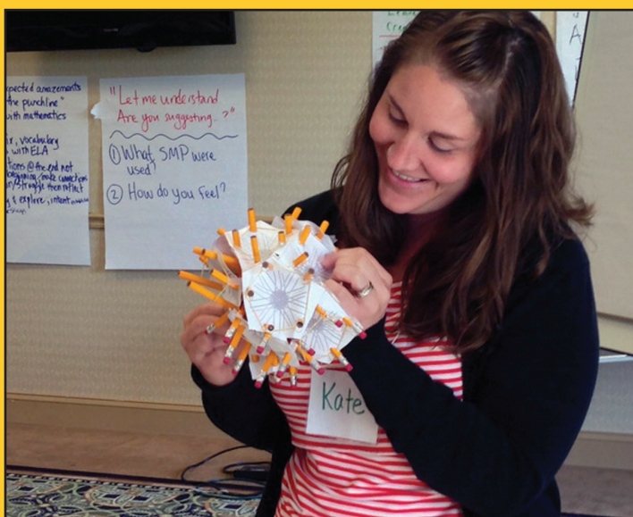
Scenes from the Southeast Ohio MTC's summer workshop at a new local Holiday Inn Express in Athens, Ohio. From top are pictured Operation Cookie Jar, math bracelets, and Pencilcusa activities.